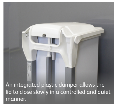
An integrated plastic damper allows the lid to close slowly in a controlled and quiet manner.