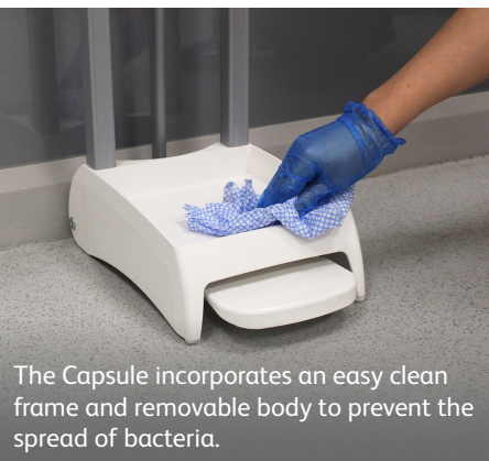
The Capsule incorporates an easy clean frame and removable body to prevent the spread of bacteria.