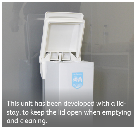
This unit has been developed with a lid-stay, to keep the lid open when emptying and cleaning.