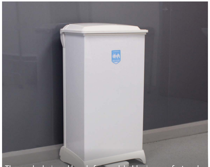
The newly designed hands-free sack holder is manufactured using high impact plastic components and features rounded corners with no sharp edges.